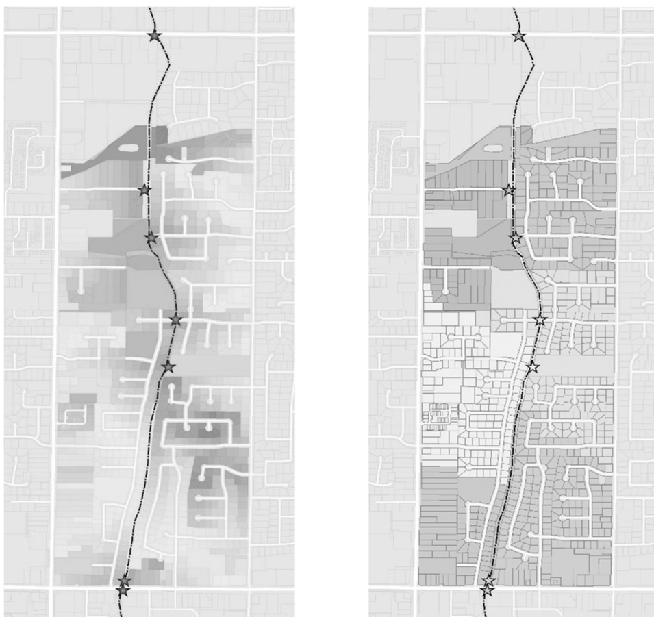
Fig. 3. Maps of relative distance between residential parcels and the nearest access points (AP) (left map) and the boundaries of each residential area linked to a specific access point (right map).